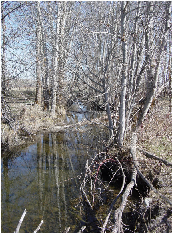
Tributary to Yakima River, Holmes property