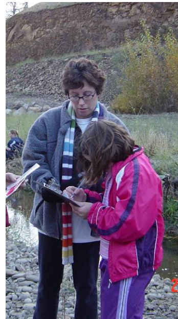
Student and teacher record monitoring data at Snyder Creek, October, 2004.

Mid-Columbia Fisheries developed a new brochure this year, which was distributed (along with other outreach materials) to interested residents at the Skamania, Klickitat, and Kittitas County fairs, and other watershed events in the region.