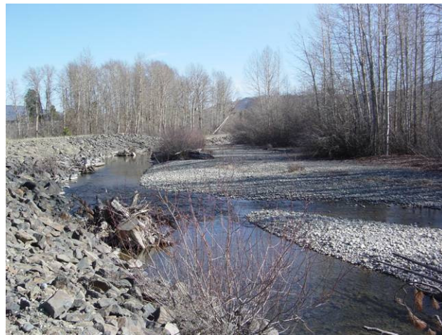
Large wood placed in side-channel at Hanson Ponds