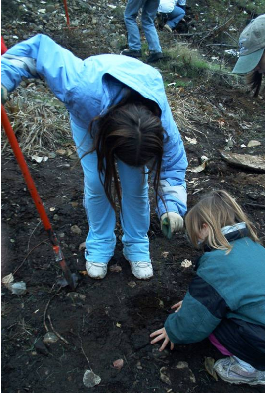
Fourth graders plant trees along Snyder Creek

Mid-Columbia Fisheries Enhancement Group is working to restore riparian areas on a number of rivers and streams in our region. This year, Mid-Columbia Fisheries sponsored volunteer work projects at sites in the Klickitat and Wind River basins. Contract and Americorps crews are revegetating other sites.